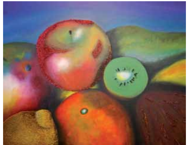
Fruit by Tessa Fish

Make making, chewing gum under tables, photography, London buses and jam making; Just some of the activities that students have embarked upon in order to produce exciting, original and interesting work this term.