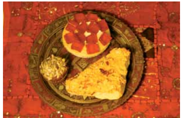
Spicy Cake by Jess Quinn (Yr13)

The department continues to go from strength to strength. The GCSE students celebrated the best set of results to date: 76% A-A* and 100% A*-B. The IB students all achieved a Level 5 or greater. The department congratulates the artists from last year and thanks them for their hard work, dedication and impressive natural talent.