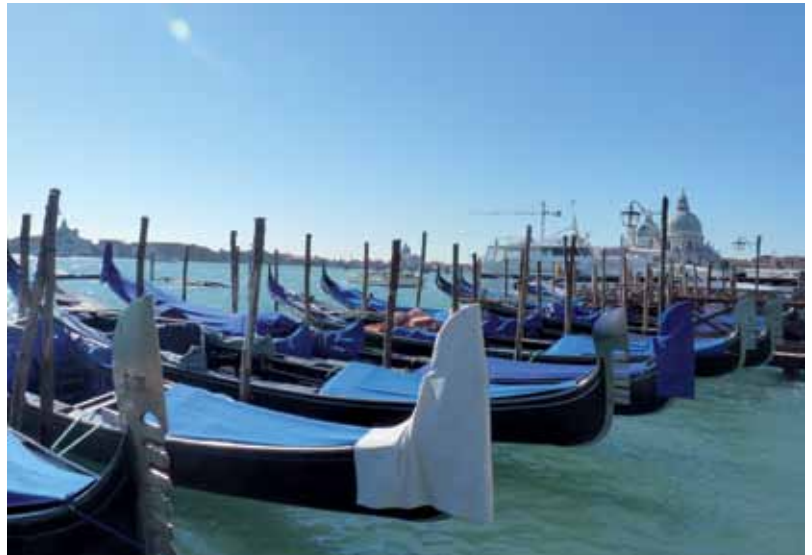
Waiting for a parking space!