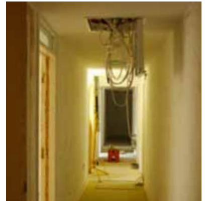
Day Boarders Room (top left), Common Room (top right), First Floor Corridor

When I saw the finished product, it seemed even better than I had imagined, and I have quite a big imagination. At first, the house felt a bit alien, a bit new, but after the first week, everyone knew where everything was and we all started to feel at home with our new Wii and more importantly our brand new IT suite. A year on, the house still looks just as new, just as girly with the purple colour schemes, but a lot more like home. Winchester now has 84 girls but still feels as much like home as St. Alban's did. In September, the Yr 10's will be moving across to Roding House and will look forward to experiencing the new extension that is presently being constructed now which should be ready after the October Half Term.