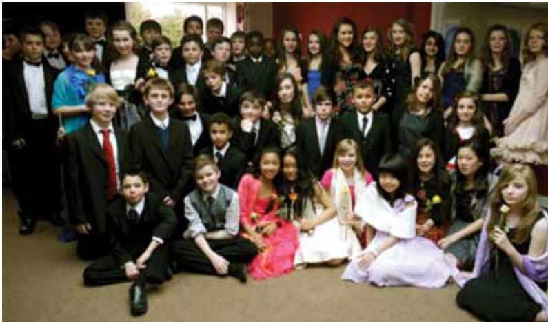
Year 7 Boarders before the Easter Dinner

was a completely new thing to all of us. The boarding staff had taught us a lot and everyone had their listening ears on and was willing to listen. Many of us joined lots of clubs and were enjoying them hugely. All the weekly boarders went home at the weekend and got welcomed back by the members of staff in the House Office who were always very kind. The full boarders always had stories to tell about their weekend whether it was good or bad and they always made it interesting to listen to.