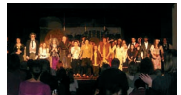
The cast receiving a standing ovation

The musical took two years to write and four months to rehearse. Including the sound and light team, the musicians, the backstage crew and parent helpers, it involved more than eighty people and raised over £3300, to be split