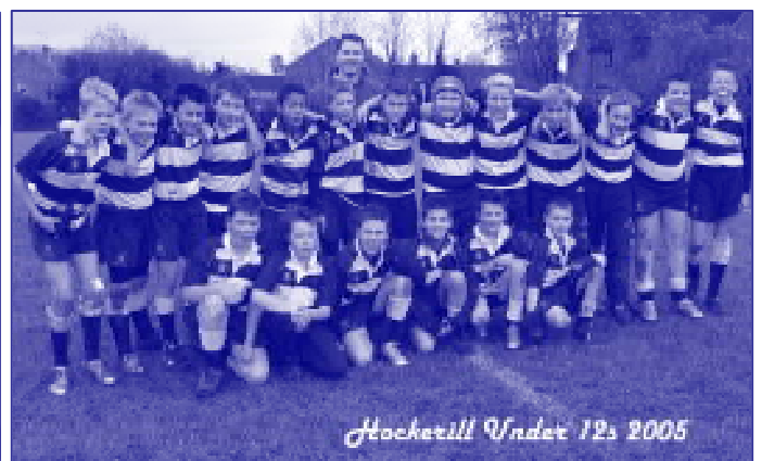
Hockeyville Under 12s 2005