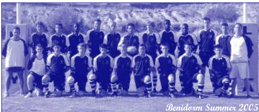
Benidorm Summer 2005

We appreciate any support you can give in coaching, spectating or helping to transport students to their matches.