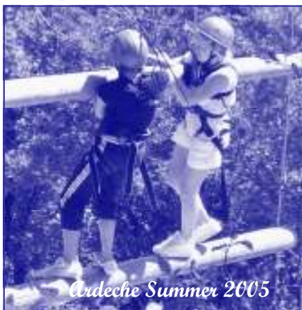
Audeche Summer 2005