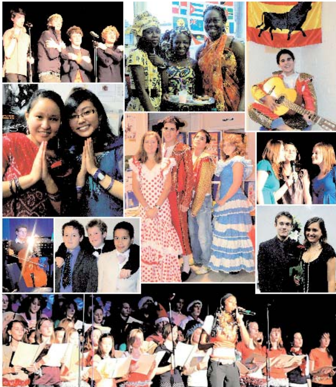
Images from Boarders' Internataional Open Weekend and Christmas Celebration Concert - December 2007

Hockerill Anglo-European College, Dunmow Road, Bishop's Stortford, Herts, CM23 5HX 01279 658451 www.hockerill.herts.sch.uk