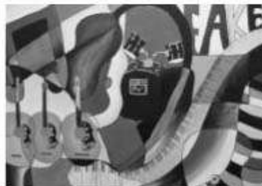
Above left and right: Examples of Year 11 GCSE coursework based on a musical theme.