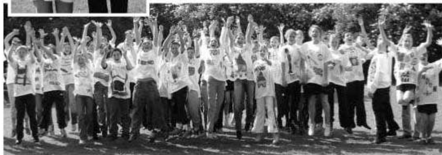
Above: During Activities Week our Year 8 pupils enjoyed an art project with our exchange students from Dagneux and Munster. We visited the Tower of London and the London Eye, along with a tour around the historic city of Cambridge. The students then created a t-shirt design based on the research they had collected. They painted directly on to the shirts using fabric paints. It was very hard to choose between the many excellent designs, however two of the best are shown above.