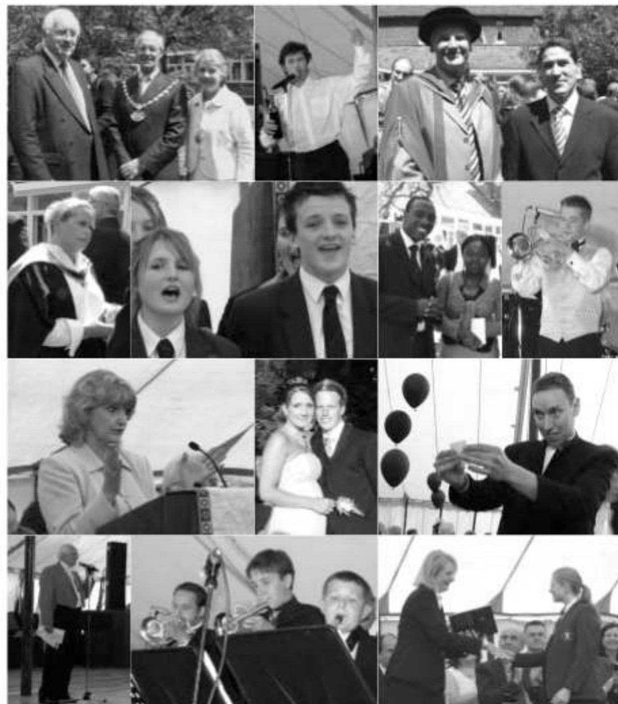
A Memorable Day Speech Day and Midsummer Ball 24 June 2006